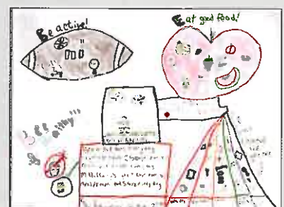
3rd Place Kaley Braselton [Cap Rock Telephone]