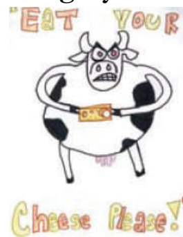
2nd: Ashely Allred [Cap Rock Telephone]