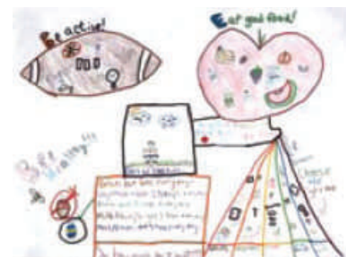
3rd: Kaley Braselton [Cap Rock Telephone]